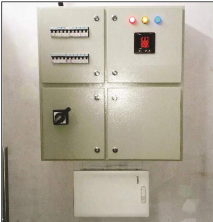
Electrical Panel in a Branch.

In Server room and ATM room, keep provision for additional sockets from alternate UPS DB so that in case there is some problem with one UPS the same can be switched over to another UPS by just shifting the connection from one socket to another.